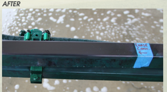
Erase concentrate after rinsing.